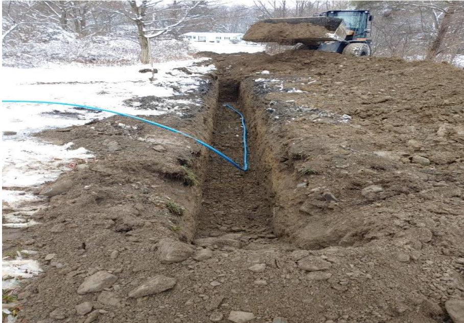
Water line ditched and laid December 2019