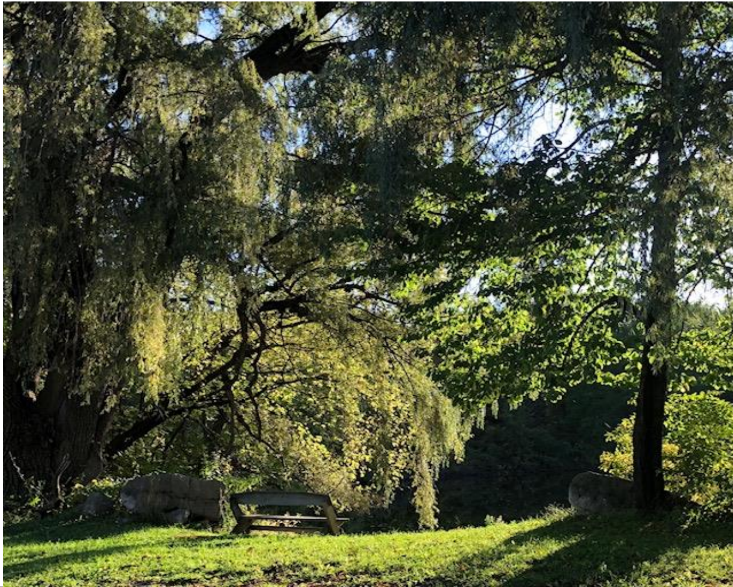
Jacksonville Community Park Pond with Willow and Donated Bench