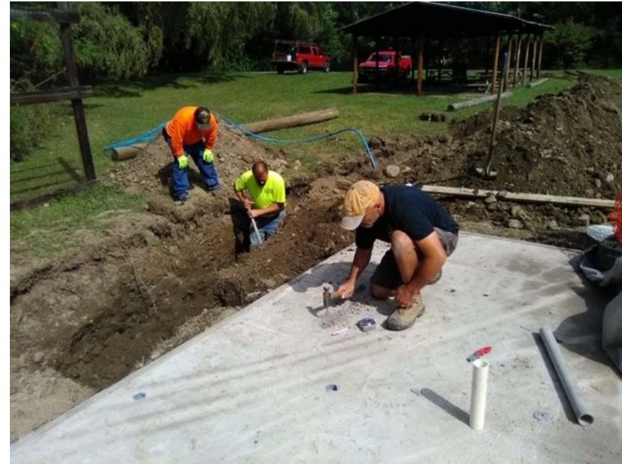
Pad for restroom poured by Houseworth and water line connected by Town in August 2020