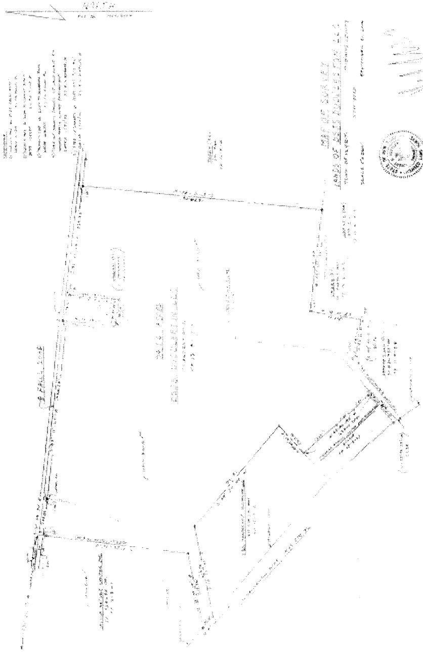
EXHIBIT A SURVEY

(1) This map was prepared by the Surveyor General of the State of North Carolina, under the authority of the Board of Surveyors, and is a true and correct copy of the original map on file in the office of the Surveyor General. (2) The map was prepared by the Surveyor General of the State of North Carolina, under the authority of the Board of Surveyors, and is a true and correct copy of the original map on file in the office of the Surveyor General. (3) The map was prepared by the Surveyor General of the State of North Carolina, under the authority of the Board of Surveyors, and is a true and correct copy of the original map on file in the office of the Surveyor General.